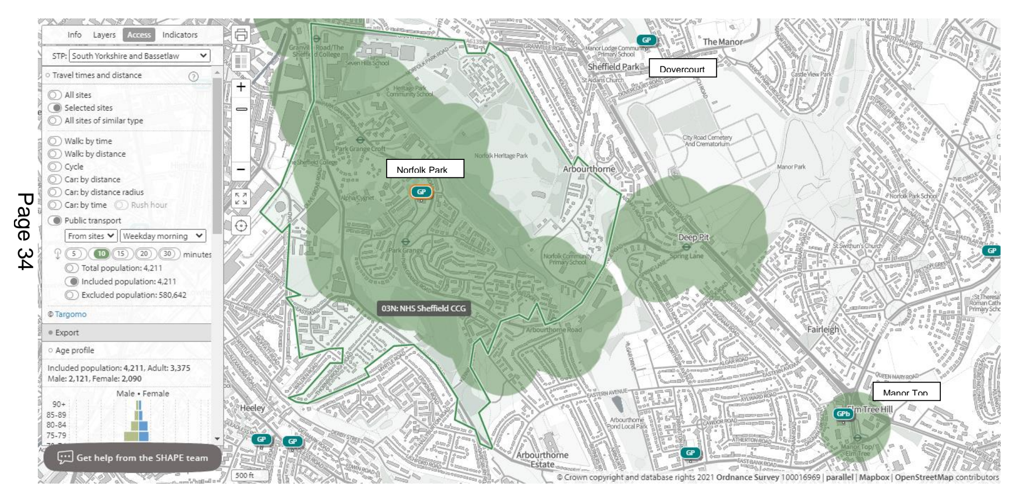
Map 2: Travel Times from Norfolk Park Surgery

The green shaded areas are accessible within 10 minutes by public transport from Norfolk Park Health Centre.